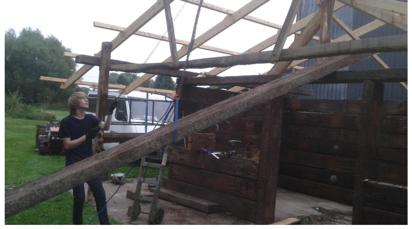
Annotate the diagram fully. Show forces acting on the sleeper, distances and angles:

A 6m long sleeper of mass 200kg is being held in equilibrium balanced on a point 1.5m from one end and held by a chain 2m from the other end. The sleeper is inclined at an angle of 30° to the horizontal, and the chain is inclined at an angle of 20° to the vertical.